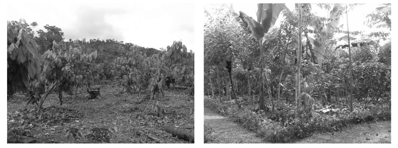
Figure 1 : Left panel: young MONO in Bolivia. Right panel: young SAFS after shade tree pruning in Bolivia. Pictures were taken four years after cocoa tree planting.

AF), and ii) management practice (CONV vs. ORG). The combination of the two factors make up the system effect. Figure 1 shows example plots of a MONO CONV and a SAFS four years after planting the cocoa trees.