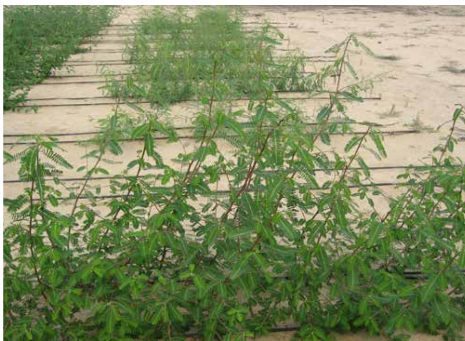
Sesbania is another plant that is resistant to heat and salinity. It is used as fodder.

In addition to its work on climate change modeling and adaptation, ICBA has also identified and developed several climate-smart innovations like energy-efficient net-houses, integrated aqua-agriculture systems, climate-resilient crops such as quinoa, sorghum and barley, which can withstand climate extremes and high salinity. The center's work on climate change is in line with the Paris Agreement, which calls for ambitious efforts to fight climate change and adapt to its effects. Under its mandate, the center is fully committed to working towards the Sustainable Development Goals (SDGs), particularly SDGs 1 and 2 on poverty and hunger, as well as SDGs 6, 13, 15 and 17. The SDGs call for new, integrated approaches to tackling global problems such as poverty, hunger and climate change.