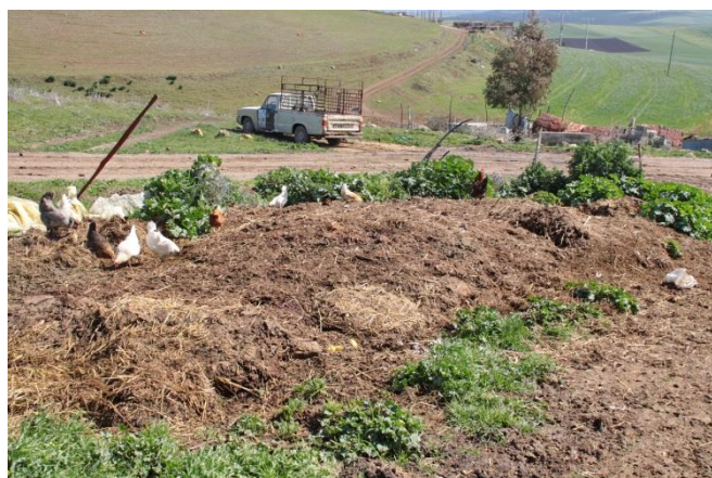
FIGURE 1 Months of unprotected storage greatly reduces the fertiliser value of manure.

The overall nitrogen losses from manure are estimated at approx. 40% (IPCC, 2006). Most nitrogen is lost as ammonia (volatilization) and nitrate (leaching and run-off). A 40% loss of a total of 70 million tonnes of nitrogen applied to soils (including pastures) with manure from swine, poultry and cattle, implies the loss of approx. 28 million tonnes of nitrogen; which accounts for about a quarter of the total nitrogen use with synthetic fertilisers (FAO, 2016).