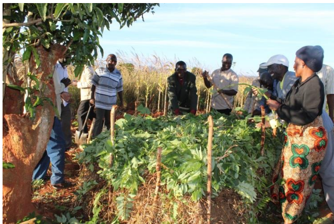
FIGURE 7 Extension workers building a compost pile during a field training in Malawi.

On many smallholder farms in the tropics urine of livestock is lost through discharge and only the solid cattle droppings are stacked. This growing manure pile is left in the open air until the next cropping season, during which period many nutrients get lost through leaching, run-off; and volatilization. Active composting, meaning building a layered compost pile followed by regularly turning and mixing, prevents a large loss of valuable crop nutrients.