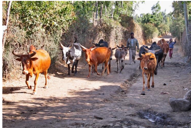
FIGURE 4 Cattle returning from the communal pastures to be confined during the night.

Best practices for Integrated Manure Management depend on local circumstances. It is not a 'one-size-fits-all' approach (Teenstra et al., 2015). Key factor is the housing system, because the housing system determines whether dung and urine are collected or collectable and therefore determines the manure characteristics at the start of the chain.