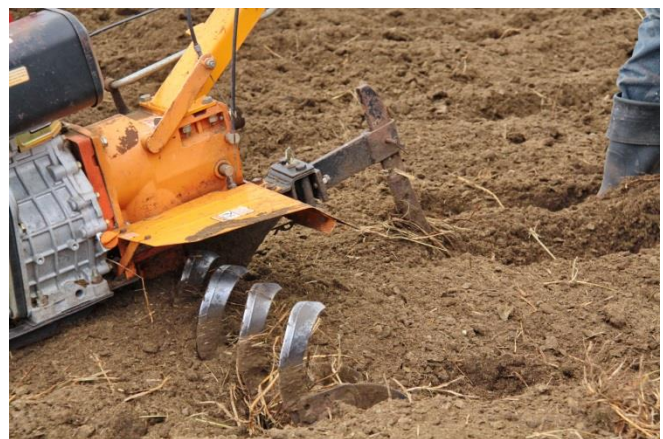
FIGURE 6 A small rotary tilling machine expedites the manure to dry and thus eases manual spreading on steep hills.

Steep hills and mountains often complicate proper application of livestock manure. Mechanised manure application on these pastures is impossible due to the steep slopes and abundant rainfall. Therefore most dairy farmers use synthetic fertiliser and discharge their manure as a waste (ending up in surface waters). A Costa Rican highland farmer found a solution to tackle this bottleneck. His 20 cows are confined in a plastic covered kraal for approx. 8 hrs. a day. The farmer invested in a small rotary tilling machine used in horticulture to mix and turn the topsoil of the kraal consisting of approx. 90% manure. Fresh dung is mixed with the old dung twice a week enhancing the absorption of urine and stimulating air drying in the covered kraal, providing dry bedding for the cows and an easy to store and to handle organic fertiliser for his pastures, thus saving on synthetic fertilisers. Although some nitrogen will be lost in the process; drying manure is a very effective method to prevent methane emissions. Given the circumstances (steep slopes and high rainfall) the application of dry solid manure to the grassland ensures an optimal use of the valuable nutrients.