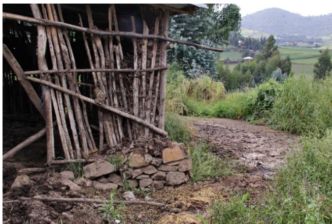
FIGURE 3 Dung and urine discharged from a barn to run off the hill

A global assessment of manure management policies and practices conducted in 34 tropical countries concluded that manure is poorly stored and handled and often discharged into the environment (Teenstra et al., 2014). Besides a general lack of knowledge and awareness, the survey revealed several barriers withholding farmers from improving their manure management, e.g. limited access to credit, illiteracy, lack of labour, the inability to handle liquid manures in a non-mechanised environment; and the fact that incentives are often restricted to the construction of anaerobic digesters and not to other components of integrated manure management. A key observation is the fact that stakeholders engaged in the enabling environment – like policy makers, credit suppliers, farm advisors, agribusiness etc. – are the main facilitators for practice change at farm level.