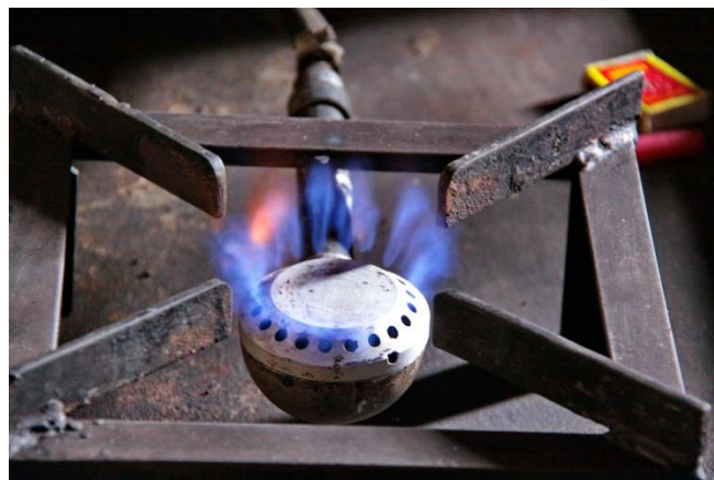
FIGURE 2 Clean burning biogas substitutes for fossil and biomass fuel.

Clean, renewable energy: Conversion of animal manure to biogas through anaerobic digestion processes provides added value to manure as a bioenergy resource, and reduces environmental problems associated with animal manure like the methane emissions, bad odour, and flies. New stove technologies and cleaner fuels, like biogas, reduce exposures to the most health damaging air pollutants (e.g. particulate matter) by as much as 90% (MacCarty et al., 2010).