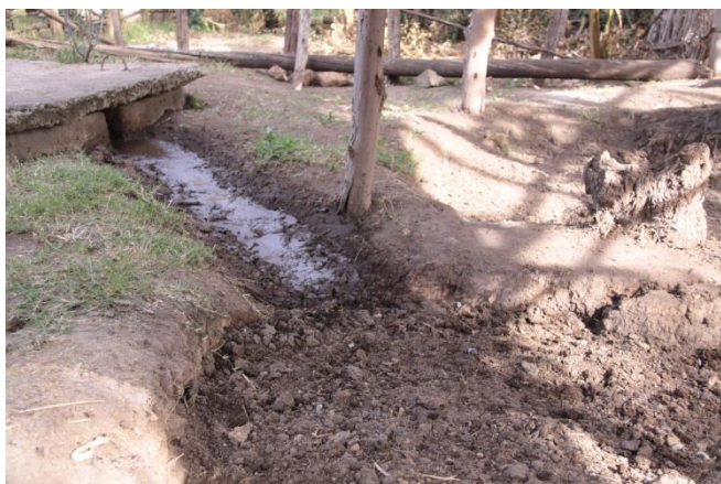
FIGURE 8 Bio-slurry flowing from a bio-digester outlet chamber into a compost pit where it is mixed with dry crop residues and feed left-overs before being covered with a thin layer of soil.

In all cases it is essential to protect the compost pits and piles from rain and sun in order to prevent storage losses.