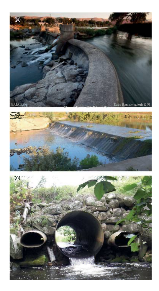
FIGURE 1 Examples of small instream infrastructure: (a) dam, (b) weir, and (c) culvert that were the focus in reviewed studies. Shown are a low head diversion dam on Yakima River, Washington, D.C.; a weir on Lez River, France; and a culvert at the intersection of a road and stream in Chequamegon-Nicolet National Forest, USA

method, we omitted studies published outside the focus of WoS such as projects lead by non-government organizations or government agencies that are either internal reports or grey literature. We also removed conference proceedings, books, and book chapters returned from our WoS search, which meant our review was based only on peer-reviewed scientific literature. Our search returned 1,060 publications, all of which were randomly assigned to six of the authors of this manuscript. The six authors reviewed abstracts from all 1,060 publications and retained 327 studies that were written in English, included a description of the infrastructure, and evaluated environmental or ecological responses in freshwater ecosystems. During the initial abstract review, the six authors noted environmental and ecological variables reported in study abstracts. From this, we created a worksheet of environmental and ecological variables to be completed, and refined as needed, during detailed reviews. The worksheet included a list of broadly defined environmental (abiotic factors) and ecological (biotic factors) response variables (Table S1). The 327 studies were then reviewed to determine (a) whether the study considered infrastructure (dams or weirs <15 m