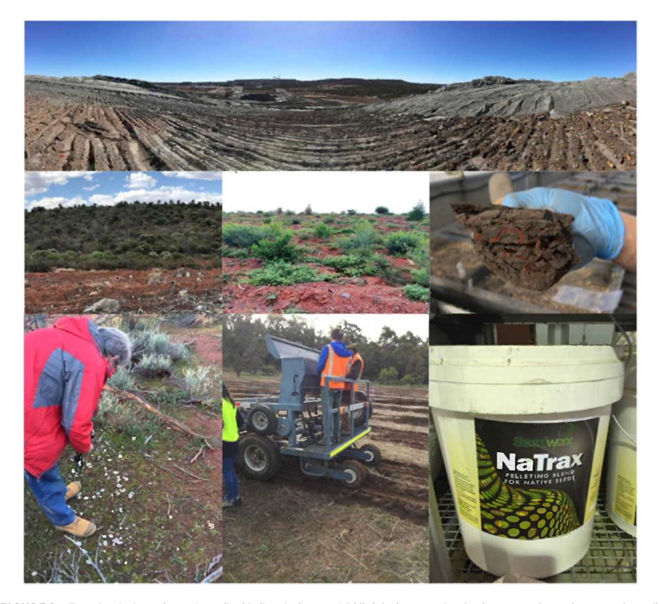
FIGURE 2 Top: mine site in southwest Australian biodiversity hotspot. Middle left: the same mine site three years after replacement of topsoil. Middle centre: plant re-establishment underway after replacement of topsoil. Middle right: tailings from the same site where topsoil (red soil) was used as an SMC inoculant. Bottom left: soil crusts have complex microbiomes. Bottom centre: direct seeding on a site undergoing restoration. Bottom right: soil microbial amendments and seed adjuvants

method for assessing soil functionality does not provide any information on taxonomy, genes present within or community structure of the microbiome.