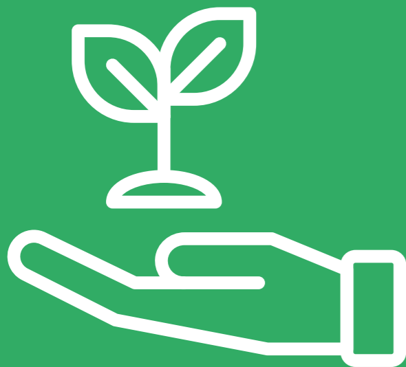
ILLUSTRATIONS: FAUZAN AKBAR / NOUN PROJECT

The previous legislative scans (Sutherland 2011–17) are available to download for free on the BES website. The issues described in those scans are not repeated here, even if still relevant.