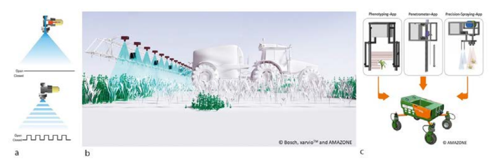
Fig. 1 Exemplary precision spraying systems – pulse width modulation (a), patch spraying of the SmartSprayer joint project (b), Bonirob (c)