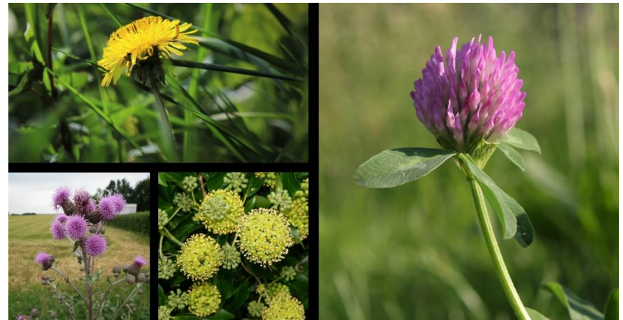
Species which flower in September such as dandelions, red clover, ivy and thistles (clockwise from top left) are likely to be disproportionately important to bumblebees and other pollinators.

Environmental Stewardship Scheme pollen and nectar mixes were found to be beneficial, though were far more effective when mown early to extend flowering into September. Late-flowering cover crops such red clover were also effective at reducing the bottleneck, as suggested by <u>previous studies</u>.