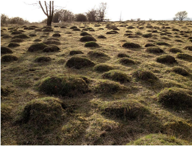
FIGURE 1 The sampled site at Aston Rowant NNR, Oxfordshire (April 2015). This grassland was intensively sheep-grazed at 8 sheep per hectare during winter every 3 years.

of the ant-hill is \pi h (3a^2 + h^2)/6000 L, and its surface area is \pi(a^2 + h^2)/10000 m 2 . The percentage cover of bare soil was estimated by eye. The presence or otherwise of a L. flavus colony within the mound was recorded on each occasion. In fewer than 3% of cases, some individuals of Lasius niger or Myrmica spp. were present.