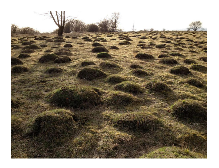
FIGURE 1 The sampled site at Aston Rowant NNR, Oxfordshire (April 2015). This grassland was intensively sheep-grazed at 8 sheep per hectare during winter every 3 years.

of the ant-hill is \pi h (3 a^2 + h^2 )/6000 L, and its surface area is \pi ( a^2 + h^2 )/10000 m². The percentage cover of bare soil was estimated by eye. The presence or otherwise of a L. flavus colony within the mound was recorded on each occasion. In fewer than 3% of cases, some individuals of Lasius niger or Myrmica spp. were present.