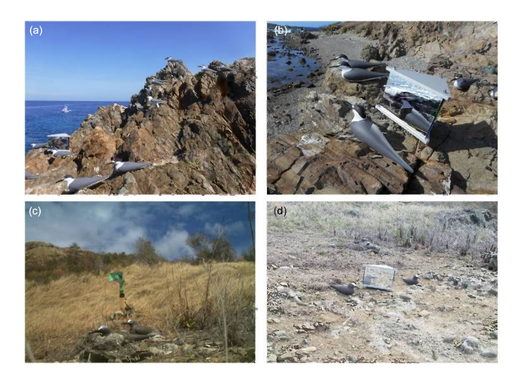
FIGURE 2 The seabird decoy colonies on Desecheo Island: (a) bridled tern; (b) bridled tern decoys with mirrors; (c) brown noddies with a speaker; (d) brown noddies with a mirror

In February 2018, we deployed 30 bridled tern decoys, five mirrors and five motion-sensing cameras at one site on the south of the island, covering 192~\text{m}^2 total area (Figures 2a and 2b). In March 2018, a large storm surge hit Desecheo and 29 out of 30 bridled tern decoys were lost, as well as all the mirrors and cameras. In February 2019, we removed the single remaining decoy and established two new decoy colonies on the west coast, one with 30 decoys, five mirrors and three cameras and the second with 32 decoys, five mirrors and two cameras.