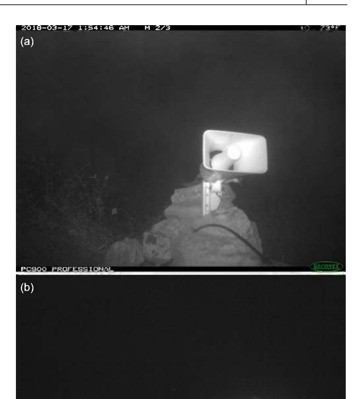
FIGURE 6 (a) First records of an Audubon's shearwater on Desecheo Island: individual perching on sound system speaker in April 2018. (b) two individuals documented in June 2019

The introduction of non-native invasive mammals to islands has had dramatic consequences to seabirds globally (Dias et al., 2019; Jones et al., 2008; Spatz et al., 2014) and is identified as a key threat to seabird colonies in the Caribbean (Bradley & Norton, 2009). Our literature review shows a decline in total abundance of seabirds and number of breeding seabird species on Desecheo in the 20th century (Table 1), during which invasive mammals including rats (present from