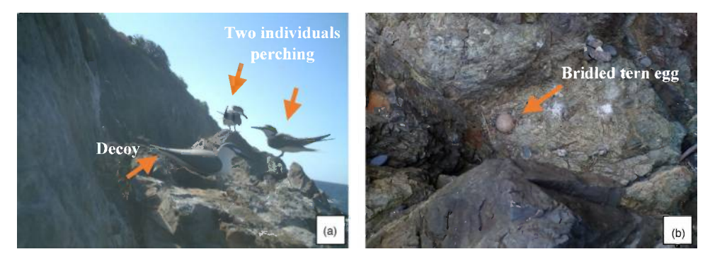
FIGURE 5 Bridled tern activity at the decoy colony established in 2018 on the south end of Desecheo Island: (a) two individuals perched next to one decoy; (b) nest with one egg near the decoy colony found in June 2018

adjacent to where the decoy colony had been placed (Figure 5a). A third nest was observed in a cliff on the south side of the island, but the presence of an egg was not confirmed. Camera monitoring was undertaken from June 2018 to January 2019 producing 330 images over 200 days and documented bridled tern activity at the decoy colony from June to August 2018, showing individuals perching and flying next to one