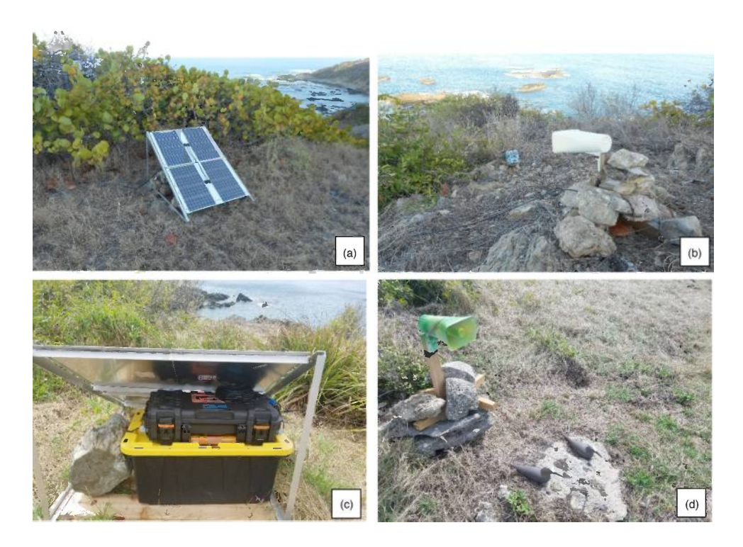
FIGURE 3 The seabird sound systems on Desecheo Island: (a) solar-powered system; (b) sound system; (c) outdoor speaker with motion-sensing camera pointing towards it; (d) Brown noddy decoy and speaker arrangement