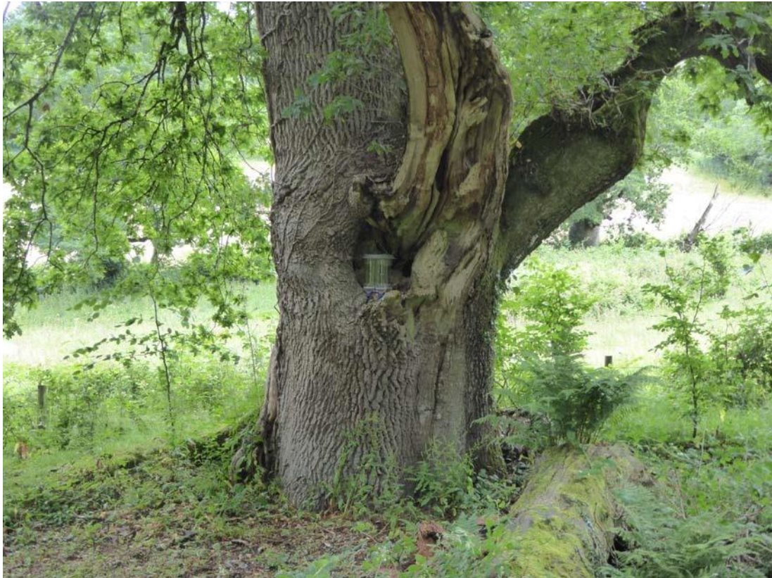
Figure 2 Flight interception trap No 1 placed at the entrance to a large trunk cavity leading to heartwood decay